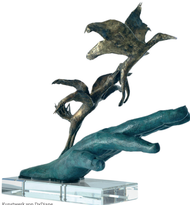
Kunstwerk von DxDiane

Course with Double Workshop from 6.02. - 8.02.2025 Distal radius fracture and associated lesions IRCAD Institute in Strasbourg